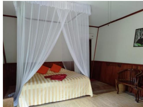
The Emerald room