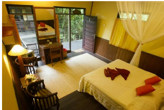
The Diamond Room with Terrace